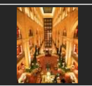
Consultation to new procurement staff at The Michelangelo Hotel.