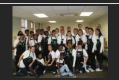
Lecture on Sustainable Hospitality to final Year Students at International Hotel School.