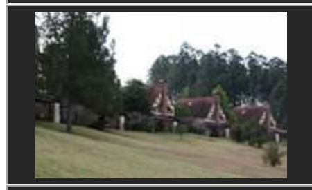
Consultation to Simone on Green Procurement at Pine Lake Resort.