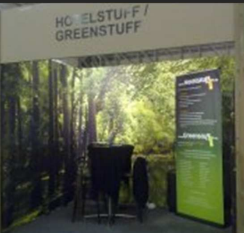
DECOREX, CAPE TOWN - Exhibition stand

WASTE IN BUSINESS SEMINAR, GREEN EXPO, CAPE TOWN - EMPEROR'S PALACE, JHB - Lorraine gave a presentation on Waste management in tourism