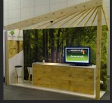
GREEN BUILDING COUNCIL, CAPE TOWN - Exhibition stand with graphic display of products

addressed audience on "How to green" your facilities management and services