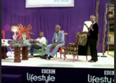
GRAND DESIGNS , COCA COLA DOME -Furnished the House of the Future with "greener" furniture and hosted a panel discussion on 'going green' in the BBC Lifestyle Theatre