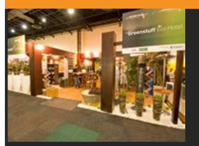
HOSTEX, SANDTON - We built and furnished a complete 90 sq.m. mock Eco Green Hotel, furnished with only eco products which were supplied by subscribers to Hotelstuff/Greenstuff