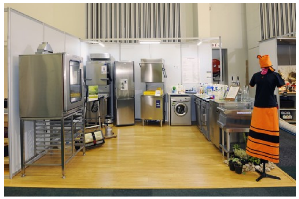
Kitchen and Laundry

Bamboo Traders; Becksware; Better Earth; Biogreen; Biowashball; Caesarstone; Hychem; Millicare; Momar; Ozone Services; PKS Electrolux; Prenox; Probac; Repello SA; Rock Of Ages; Sinkmaster; Water Solutions; Whirpool; Winterhalter