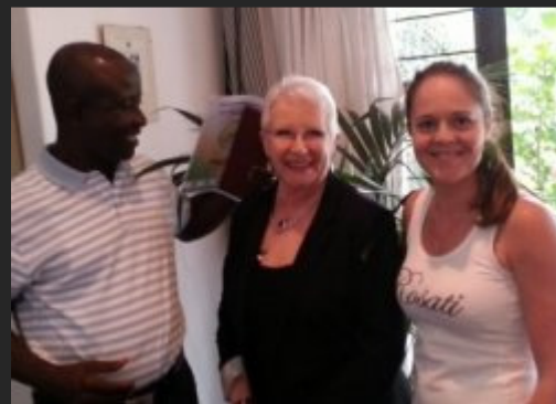
The first meeting to plan the conference in Ghana. Watch this space!