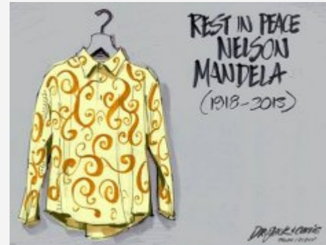
Hamba Khale, Madiba

Madiba initiated the most respected Constitution in the World. Don't you think it's time for an International Environmental Constitution and a Court for Ecocide in The Hague?