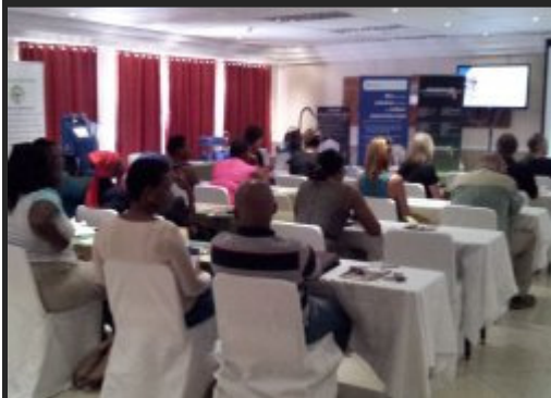
Polokwane workshop with Eskom