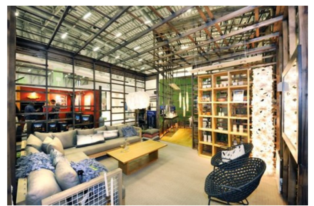
A different view of lounge. Recycled aluminium and plastic chairs, sustainable wood shelving secured with magnets, recycled plastic tall lamp, ostrich feather lamp with 6w LED lamp, rag throws, mirror frame from second hand materials.