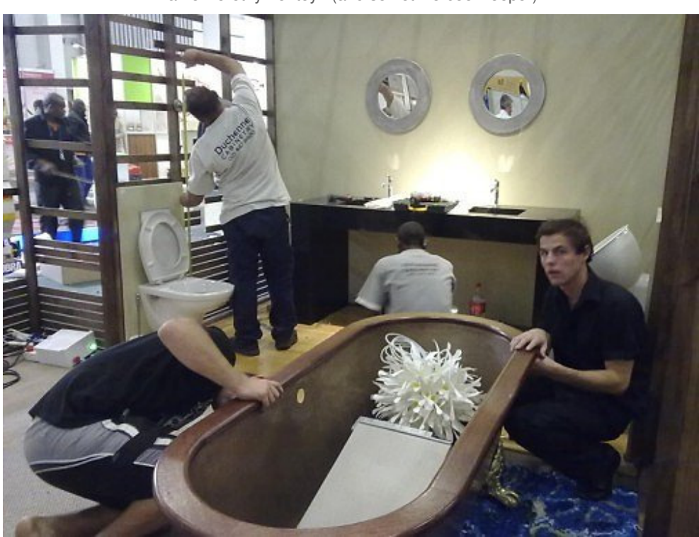
Watse ding is dit?