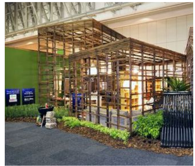
Solar panel, organic veggie garden.