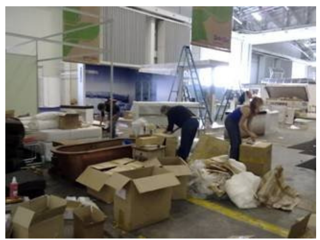
Bendy Broads unpack your stuff.