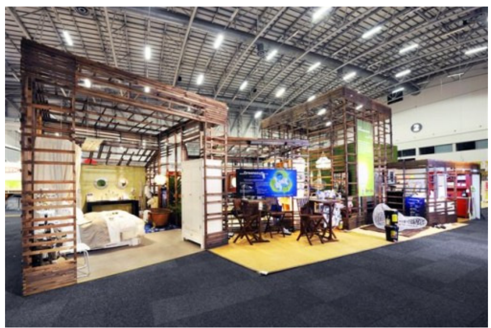
The 5-roomed Green House furnished with only eco friendly products from front to back. All materials, furniture and products supplied by subscribers to our website.