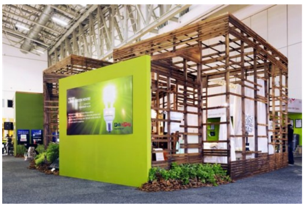
The back of the structure.