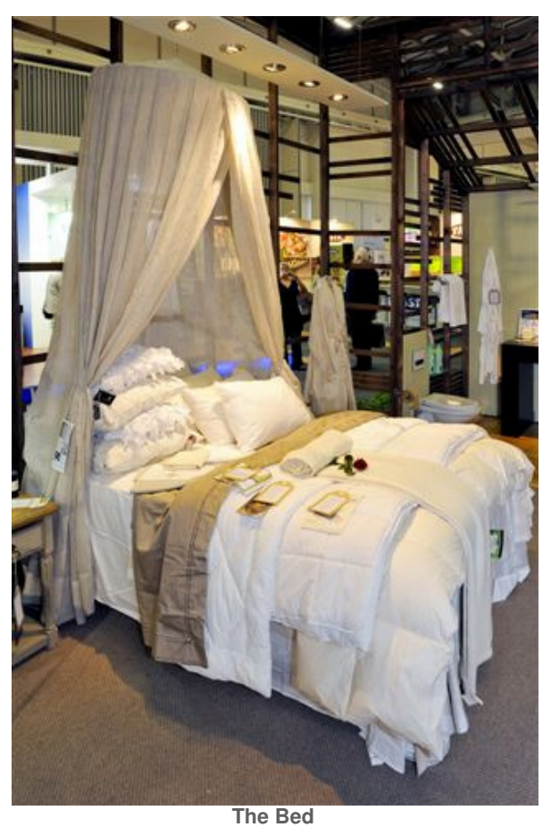
Linen mosquito net Duvets made from silk, wool, corn and goose down. Hemp, flax and organic cotton bedding. Bamboo throw. LED lighting.