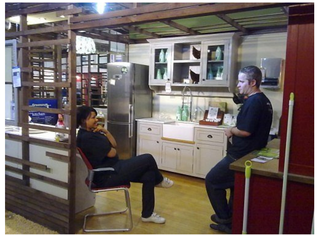
Hotel School students discuss biosustainediversedegradenontoxcicosity. Or not.