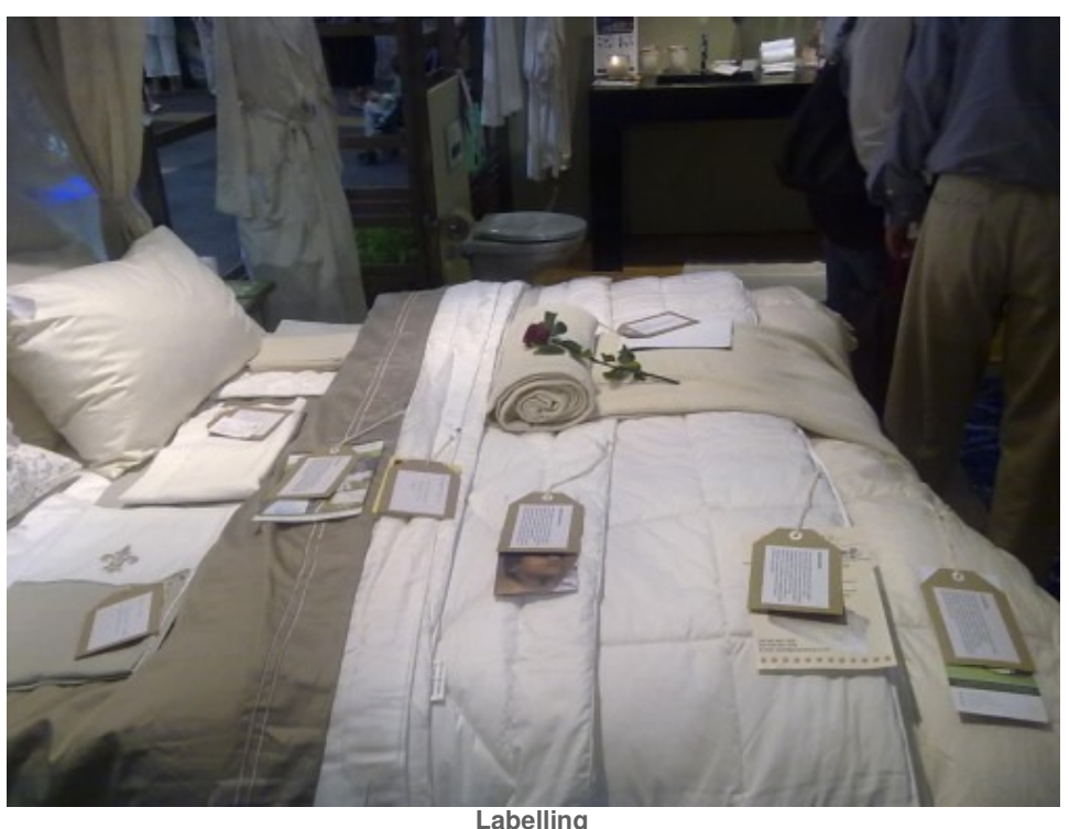
Labelling Every item in the house had a tag with Supplier's Name and the green criteria.