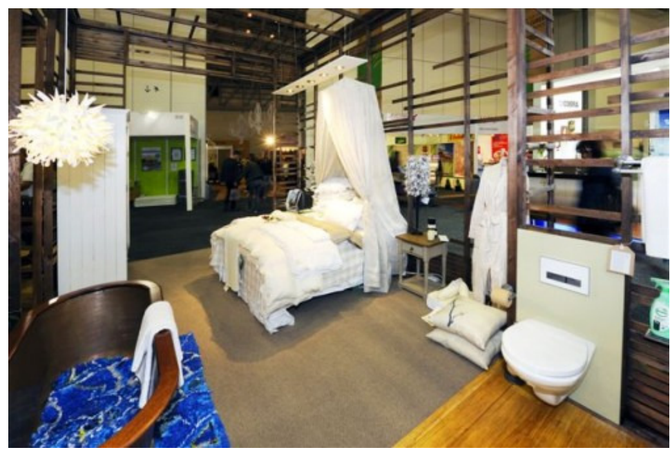
View from bathroom. Eco dual flush loo, copper bath, LED lighting and hanging light from yoghurt tubs.

Pure wool carpet, sustainable wood cupboard, recycled aluminium and plastic chair, hemp shirt and trousers.