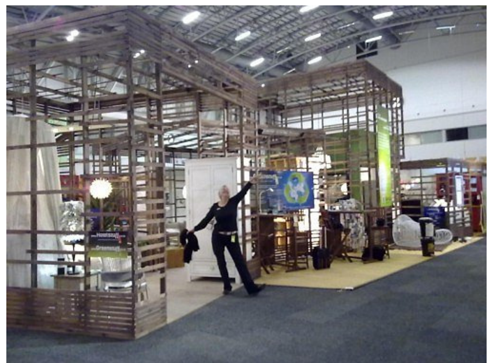
Dame Dorothy Fonteyn (and sometime bookkeeper).