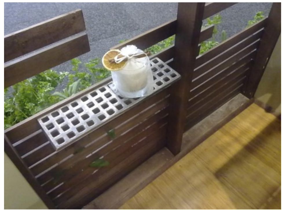
Recycled aluminium, soy candle and bamboo floor detail. Parsley/celery hybrid.