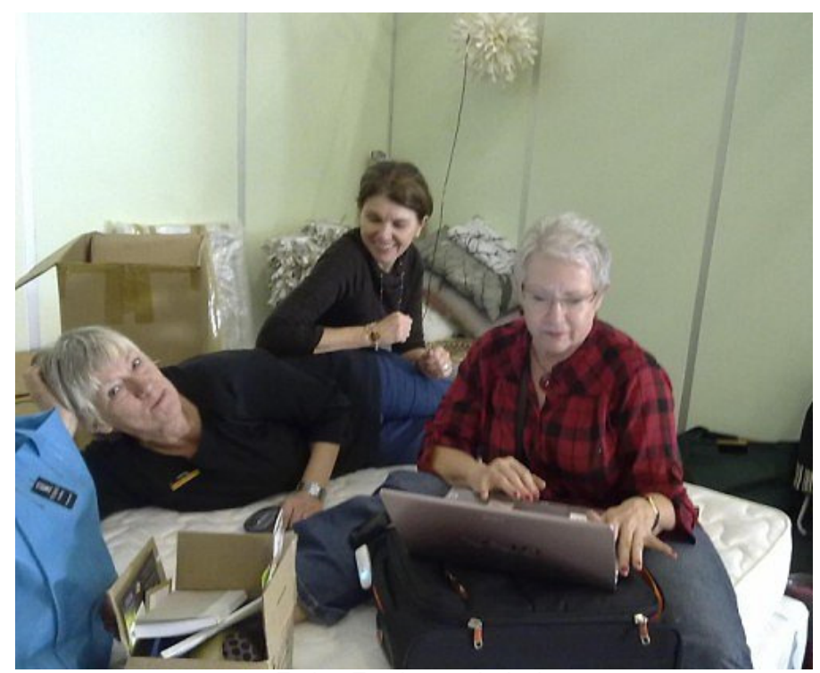
Techno Tannies test the bed.

We are repeating this project at Decorex in Johannesburg 5th to 9th August at Gallagher Conference Centre. Please visit us and let us take you on a guided tour of each room. It will change your thinking about everything you use, every day.