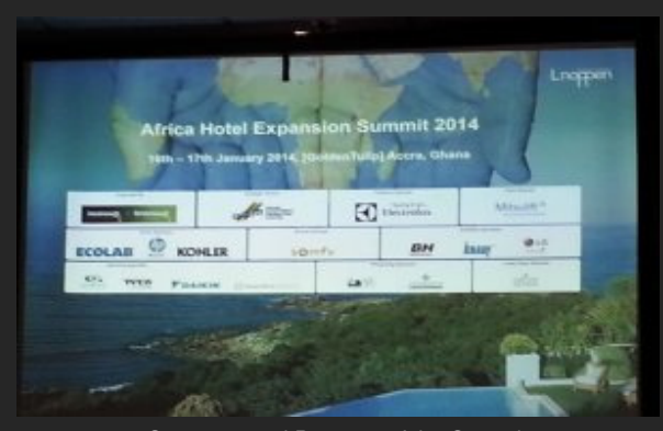
Sponsors and Partners of the Summit