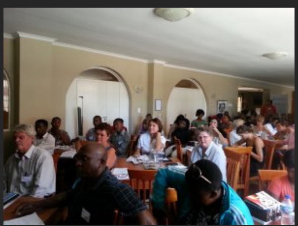
Kokstad Tourism Workshop